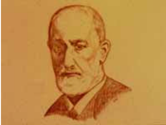
Sigmund Freud, the father of Psychoanalysis.

They didn't analyze things into smaller and smaller parts. Instead, they concentrated on how the brain achieves a "whole" (the "Gestalt," or pattern) from all the bits of information the senses perceive. Gestaltists provided many challenging problems for the other theoretical views, but offered little by way of explanation themselves. It was Sigmund Freud's psychoanalytic approach that placed the most emphasis on the dynamics of how unconscious processes effected conscious thought and actions.